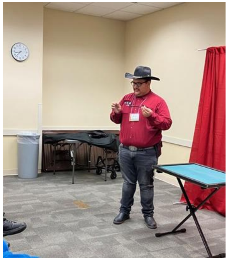
The Magic of Western kicks up the energy.