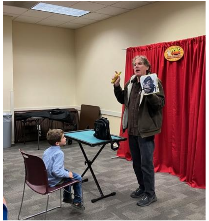
One of our newest members performs a very funny and entertaining routine