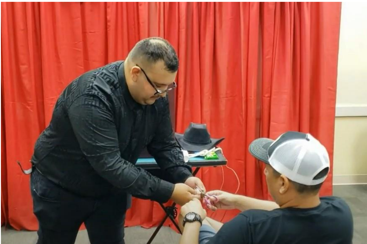
The Cut & Restored Rope