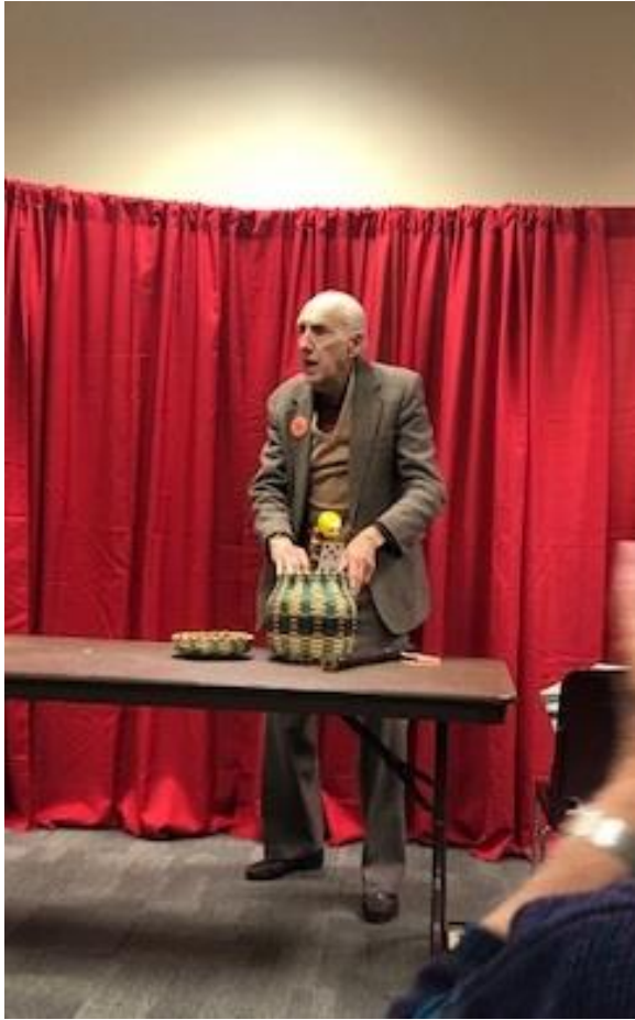
Sadie the Viper is back by popular demand to assist Mel.